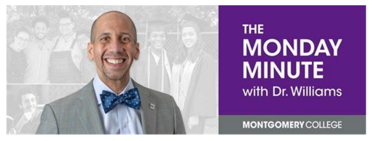
May 12, 2025

The last week of the semester has arrived! Students, MC's faculty and staff believe deeply in you and your potential. As you prepare for the end of spring courses, we are rooting for you, confident that your hard work and dedication will pay off with successes. The <u>Libraries</u> are open for study and consultation plus <u>virtual tutoring</u> to help. We all wish you the best this week!